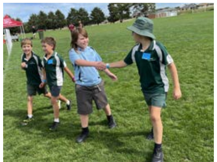
MATES ! So good to see the sportsmanship between our schools.