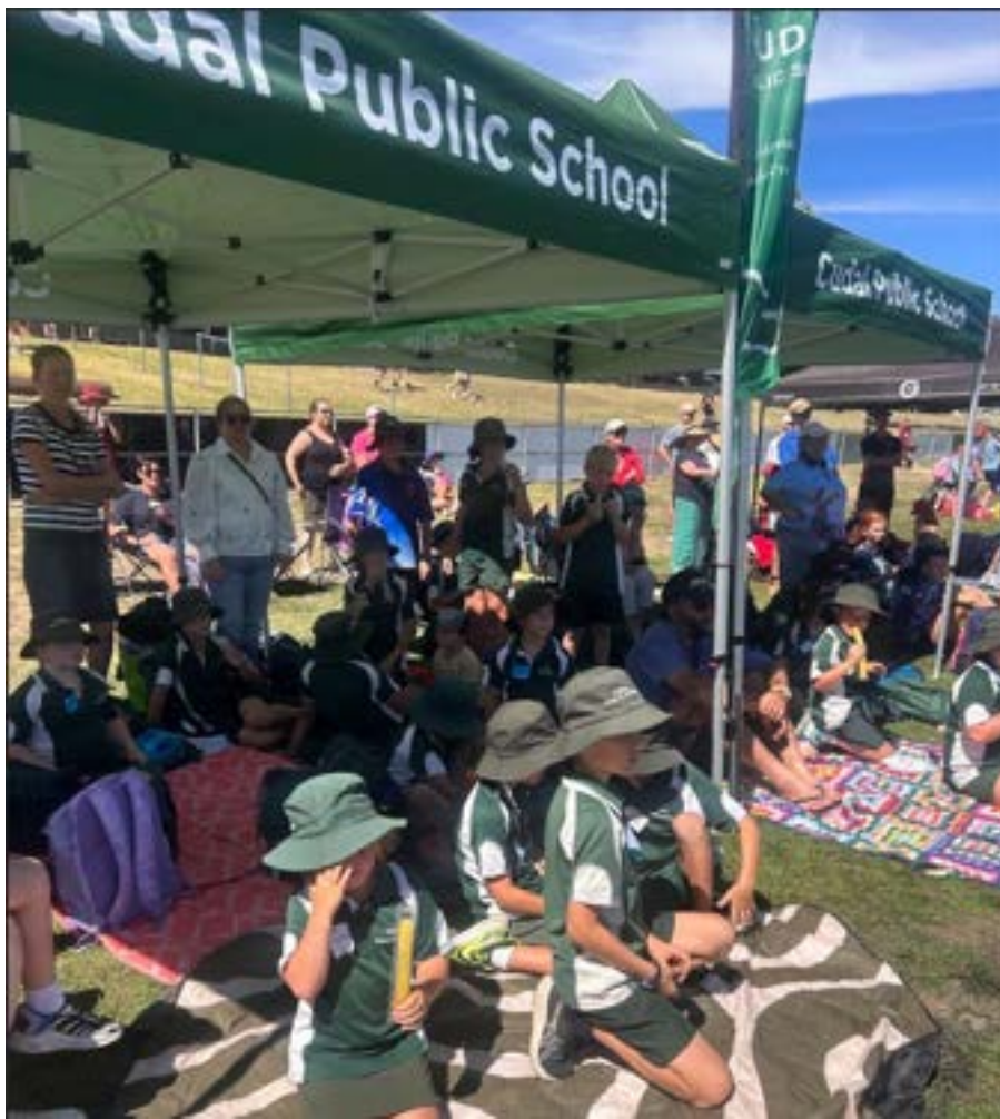
Cudal Students & Parents in Tent Area