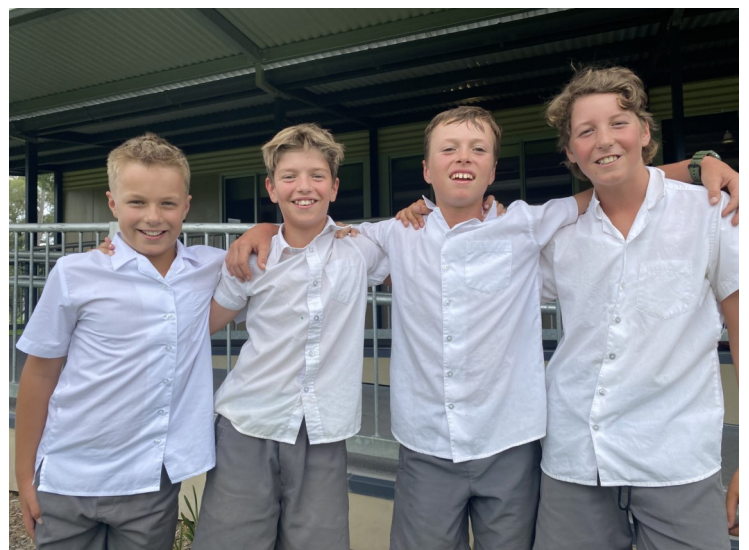
Cudal's own "Awesome Foursome", all set to hit the water in the senior boys relay in the upcoming Western carnival