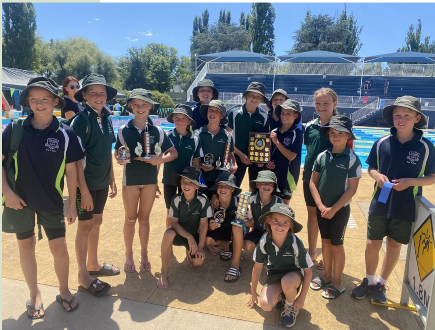
Cudal students all smiles with their swag of trophies achieved at the OSSA swimming carnival.

There will be no rest for these swimmers as tomorrow, 19 of them are now competing at the Orange District swimming carnival. Best of luck to our team and I am sure we will be writing about more achievements after this carnival.